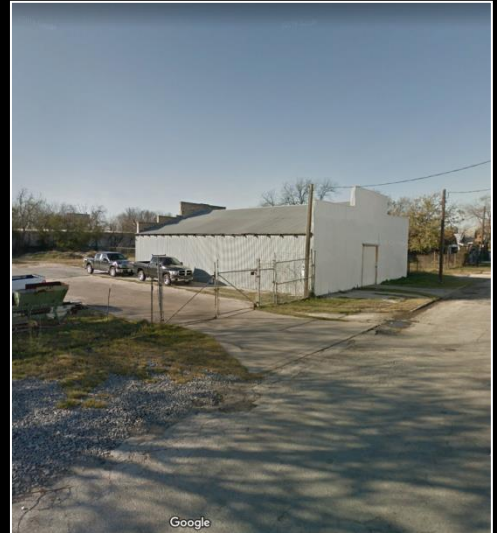
224 Virginia, (South Improvement)