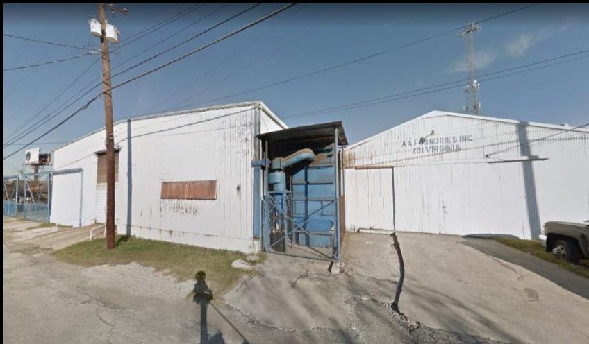
223 Virginia, (North Improvement)