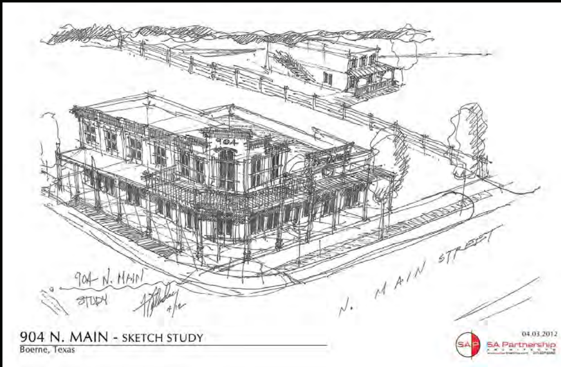
904 N. MAIN - SKETCH STUDY Boerne, Texas

04.03.2012 SAP SA Partnership ARCHITECTS